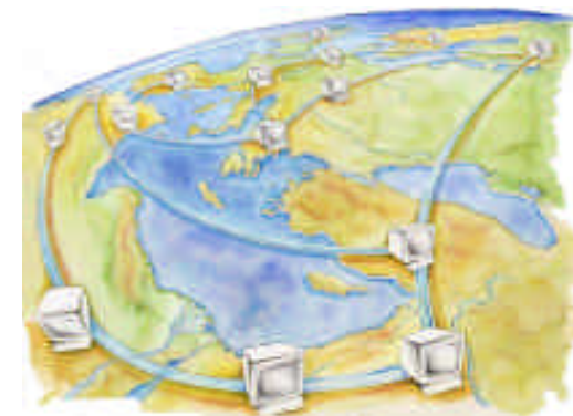
Supporting water cooperation in the Mediterranean area