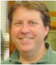
TorOve Leiknes NTNU, Trondheim (Norway) (Ex-President of the European Membrane Society) "Membrane bioreactors for advanced wastewater treatment"