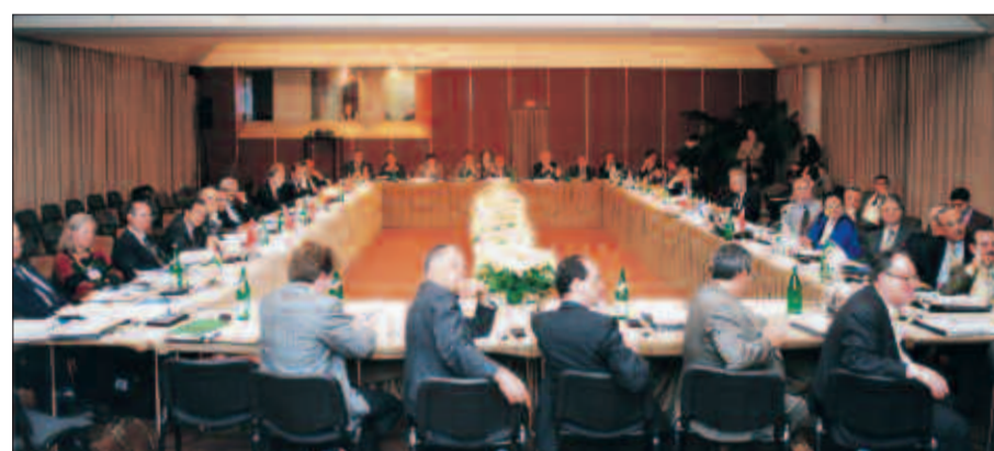
Naples, 9-10 December 1997 Euro-Mediterranean Conference of the 27 Water General Directors

previously developed for the European Environment Agency (EEA) . Thus EMWIS will benefit from existing component and, their updates and to contribute (in particular for the Arab language) to the tools of EEA. The implementation began in September 2005 and the final product will be available in February 2006.